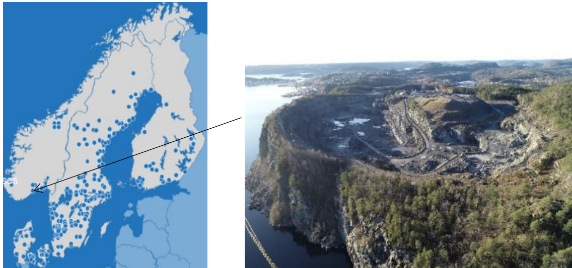
Figure 2: Map and picture showing the geographical location of the declared site.