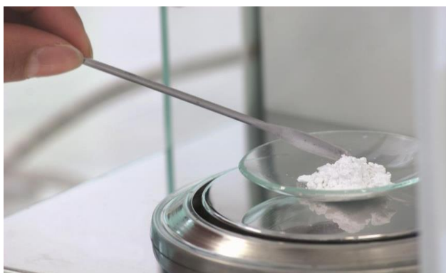
Fig. 1 Micronized limestone

Product identification and description: The micronized limestone is an ultra-fine powder, obtained by rock grinding, from quarry activities. It is characterized by a selected granulometry lower than 200 \mu\text{m} . (CA150, CA40, CA150SMP) It can be used in zootechnic, agri-food, pharmaceutical, painting and building sectors, depending on the characteristics and chemical composition of the stone of origin. It is mainly used as calcium carbonate additive in agriculture (e.g. fertilizer or chemical for organic management) and feeding-stuffs, but it can be used also in pharmaceutical sector, if the purity is high. In this document, limestone, calcium carbonate and \text{CaCO}_3 will be used as synonymous.