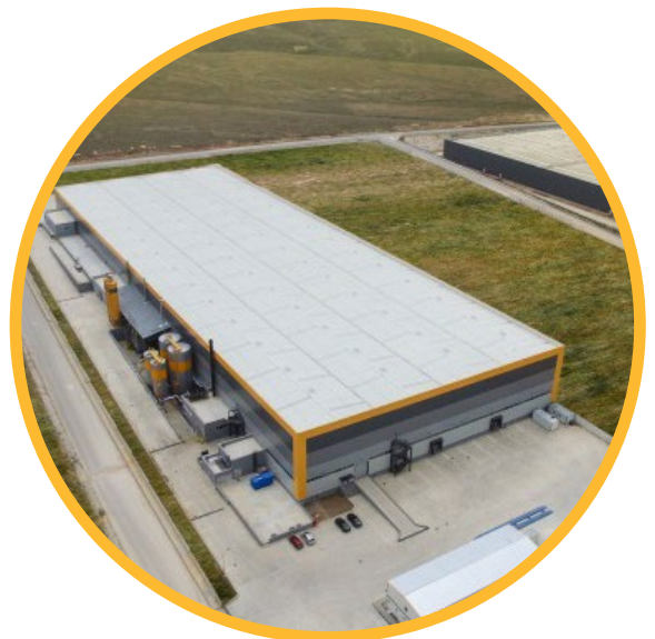
ODE Eskişehir, Turkey Production Facilities