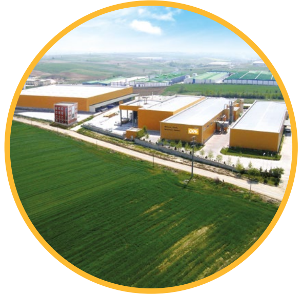
ODE Çorlu/Tekirdağ, Turkey Production Facilities

Having implemented pioneering efforts toward raising public awareness of insulation and energy awareness, and taking care to be involved in projects that will hand down permanent value to the future, ODE changed its company motto to "Insulates the Future" in 2014. In knowledge of the universal responsibility of being in the global market, ODE continues to operate as a company which encourages its social stakeholders through visionary and innovative work.