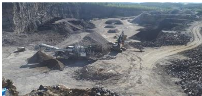
Figure 2: Map and picture showing the geographical location of the declared site.