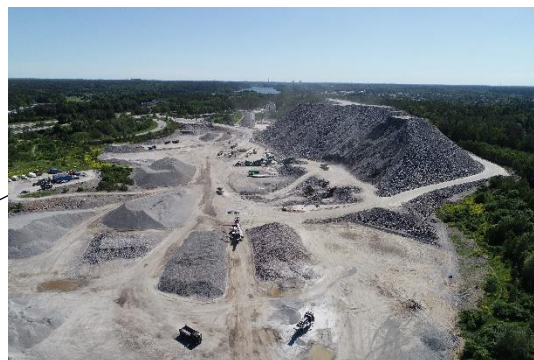
Figure 2: Map and picture showing the geographical location of the declared site.