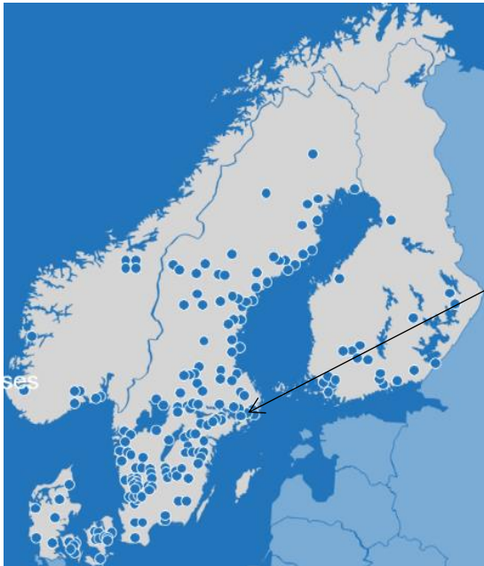
Figure 2: Map and picture showing the geographical location of the declared site.

The geographical location of the declared site is shown in Figure 2.