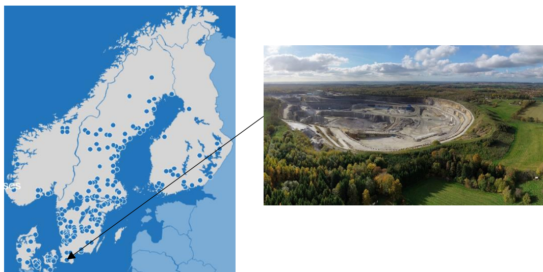
Figure 2: Map and picture showing the geographical location of the declared site.

The geographical location of the declared site is shown in Figure 2.