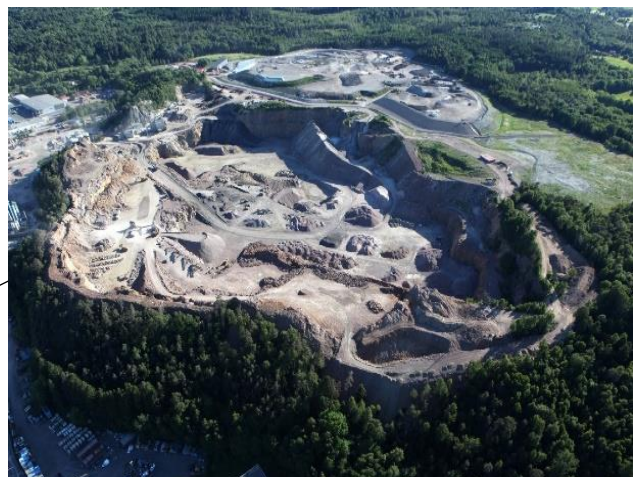
Figure 2: Map and picture showing the geographical location of the declared site.