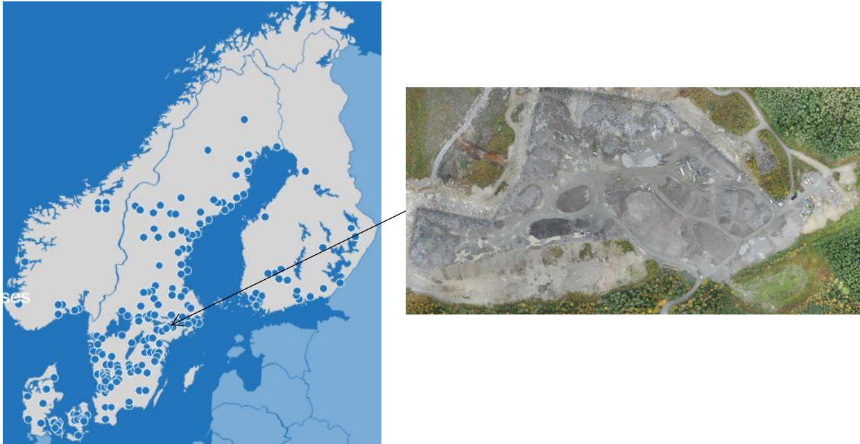
Figure 2: Map and picture showing the geographical location of the declared site.