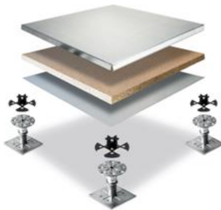
RMG600 Access Floor Panel

This product illustration shows the main elements of the panel (particle board encapsulated in galvanised steel sheet) and supporting pedestals 1