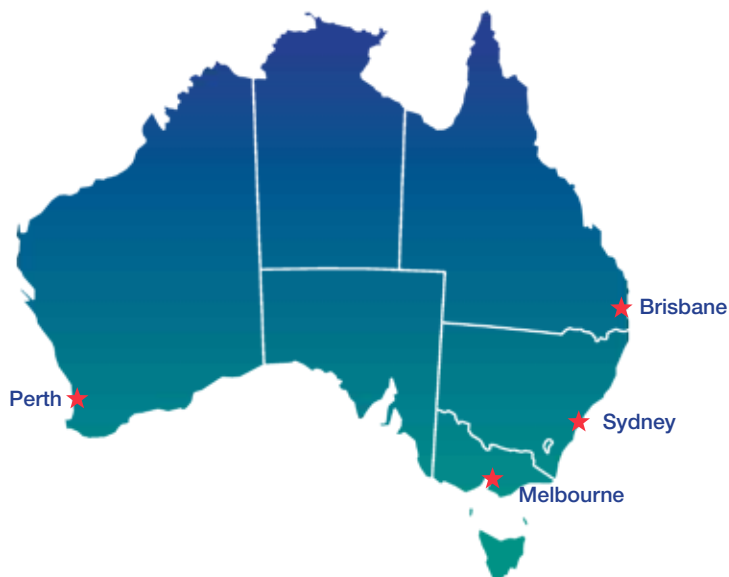
Figure 2 - Vinidex PVC pressure pipe manufacturing sites

Vinidex PVC pressure pipe manufacturing sites are shown below in Figure 2. PVC-U pressure pipes are manufactured at all sites while Supermain® PVC-O pressure pipe is only manufactured in Sydney and Hydro® PVC-M pressure pipes are manufactured in Brisbane, Melbourne and Perth. The results shown in this EPD are representative of the weighted average production of PVC-U and PVC-M pipe products at respective manufacturing sites.