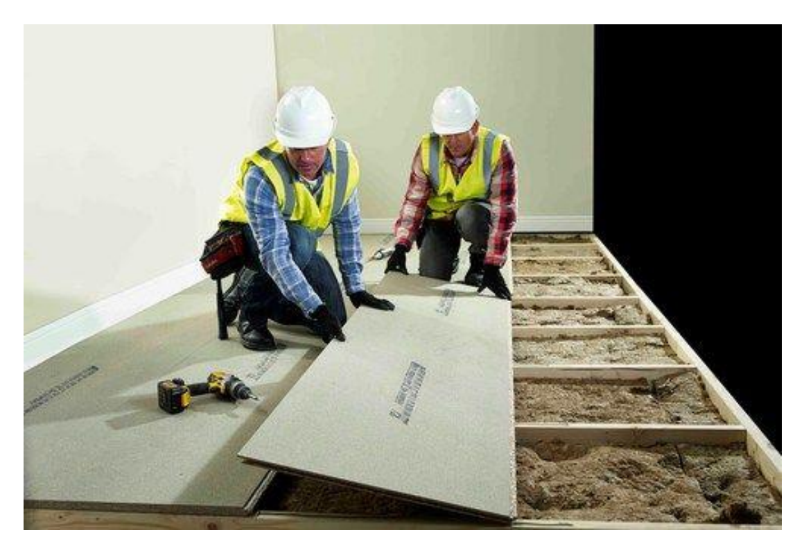
Figure 1: Particleboard flooring (Norbord Europe Ltd, Norbord Media, 2015).