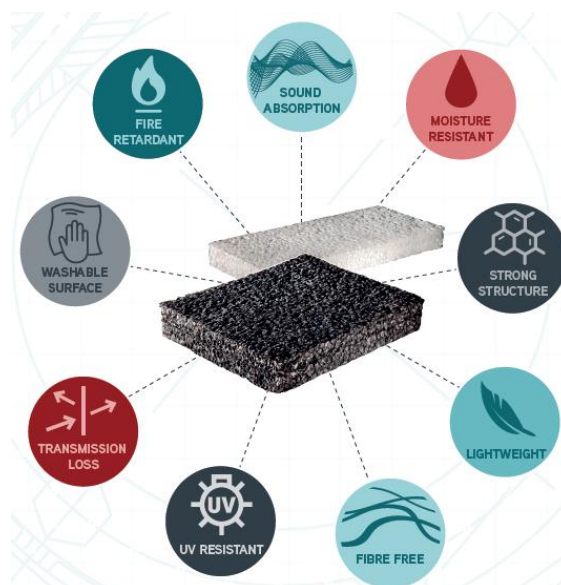
Figure 1. Whisper® acoustic panels performance attributes.

Whisper® Acoustic Panels retain their structure in wet environments. Whispers' durability means protective covers can be eliminated. Whisper at 1.4kg/m 2 (50mm) is fast to install and it's a soft plastic, so cuts easily with a knife. Whispers' unique noise reduction qualities are proven in some of the most rigorous applications, such as road & rail noise barrier walls, enclosures, and industrial machinery. Whisper® panels help to safely reduce noise, make music sound better, allow people to speak and hear one another, and contribute to a safer and more productive work environment, indoors, or outside.