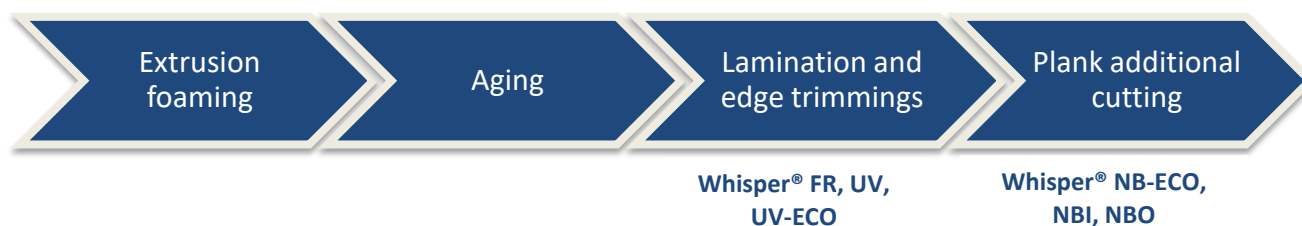
Figure 2: Whisper® Panels production phases.

Table 2 contains the materials used for the creation of Whisper® Panels.