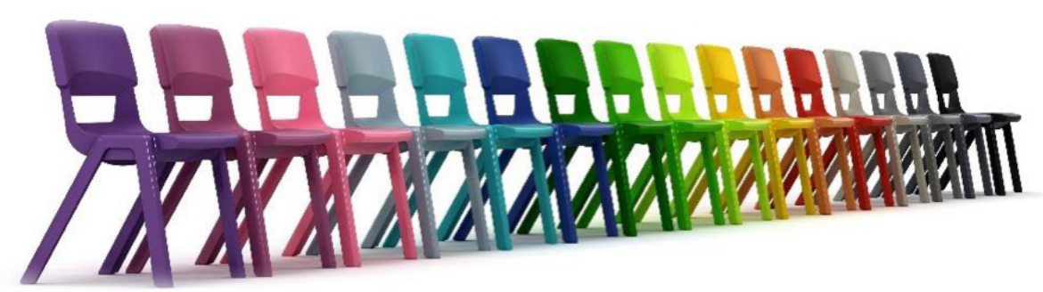
Figure 1: Colour range

This EPD applies to the Size 6, Ink Blue Postura chair, product code POPC06002. The product weighs approximately 4kg.